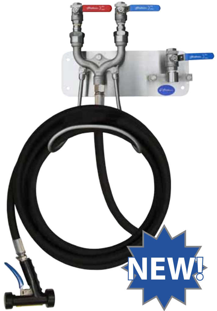
Shown: M-750 with ball valves; shown with premium hose assembly and S-70 Series nozzle.