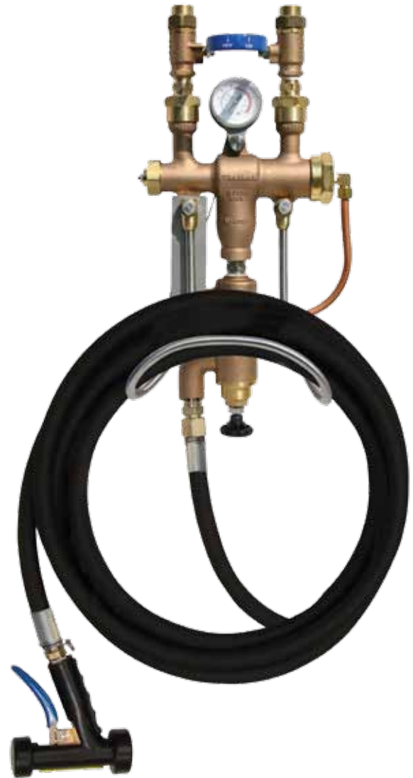
Shown: Bronze M-5000TS; shown with premium hose assembly and M-70 Series nozzle

This unit should be shut off when not in use for extended periods of time.