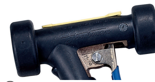
20B RUBBER COVER - BLACK