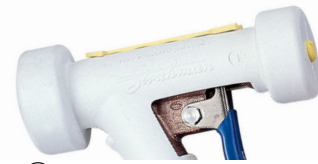
20W RUBBER COVER - WHITE