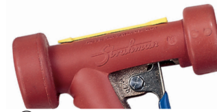
20R RUBBER COVER - RED